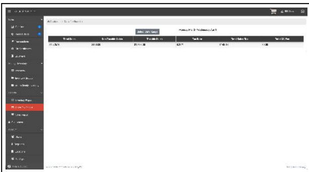
Fig. 2 — Sales Tax Report: taxable vs non-taxable sales and total tax collected

Summarizes tax collected for the selected period — total sales, non-taxable sales, taxable sales, tax rate, total tax collected, and total credit card fees.